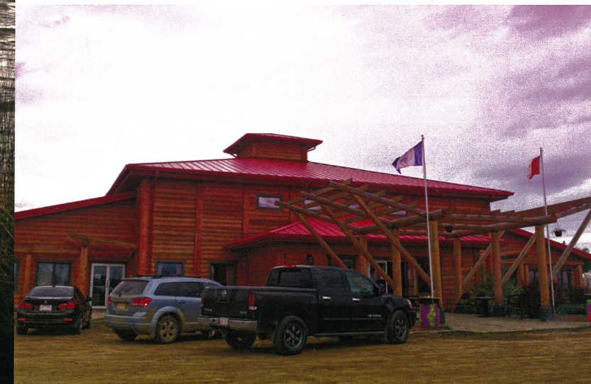
(MAIN) HEART LAKE (RIGHT) HEART LAKE ADMINISTRATION BUILDING

Heart Lake companies have successfully mobilized a trade show, which they bring to Calgary once a year. The mobile